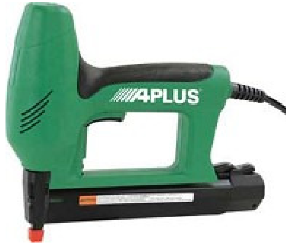
F-Type Brad Nail Staple No. 14 (90 Series)