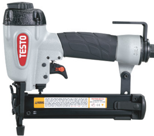
F-Type Brad Nail